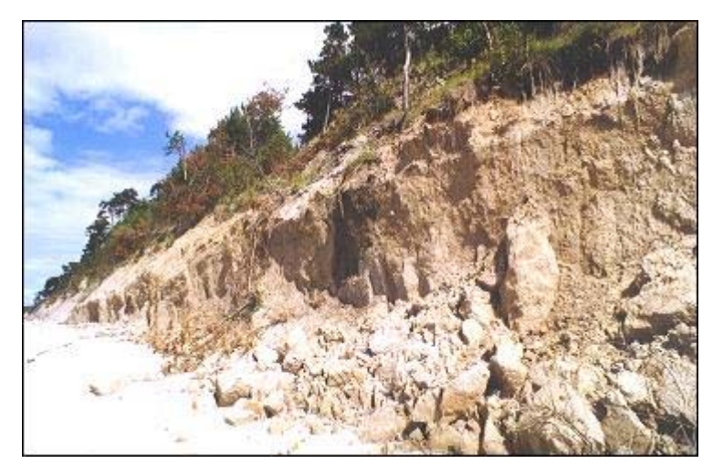
Fig. 4: Till debris at the foot of the eroded Olando kepure bluff. Photo: A. Stubra, May 1999.

In the second half of the 20^{\text{th}} century the erosion zone has expanded app. 2 – 3 km south and north from the Olando kepure bluff. The annual retreat rate of the hitherto stable coast was 0.5 - 1.0 m in the period of 1950 - 2000. The scale of the coastal retreat is witnessed by the exposure of a coastal fortification from the World War II, which was originally built in the foredune (Figure 5).