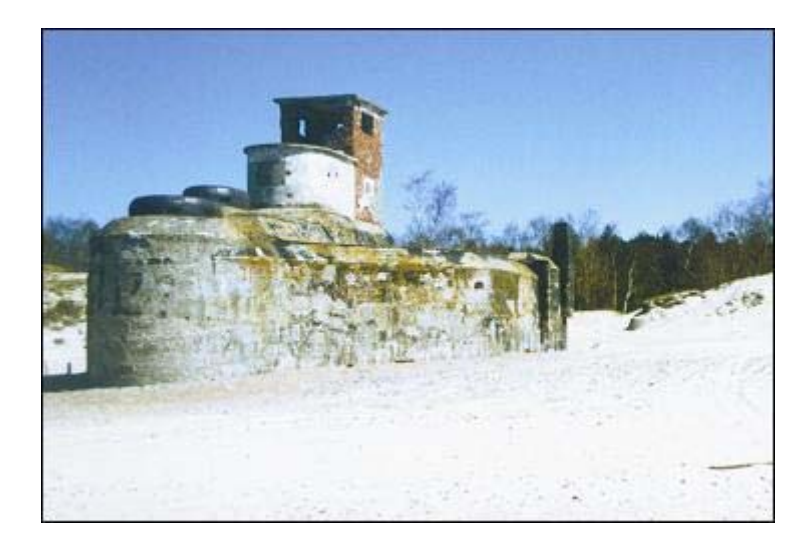
Fig. 5: World War II bunker in Giruliai, which became exposed on the beach as the foredune retreated. Photo: E. Paplauskis, May 2001.