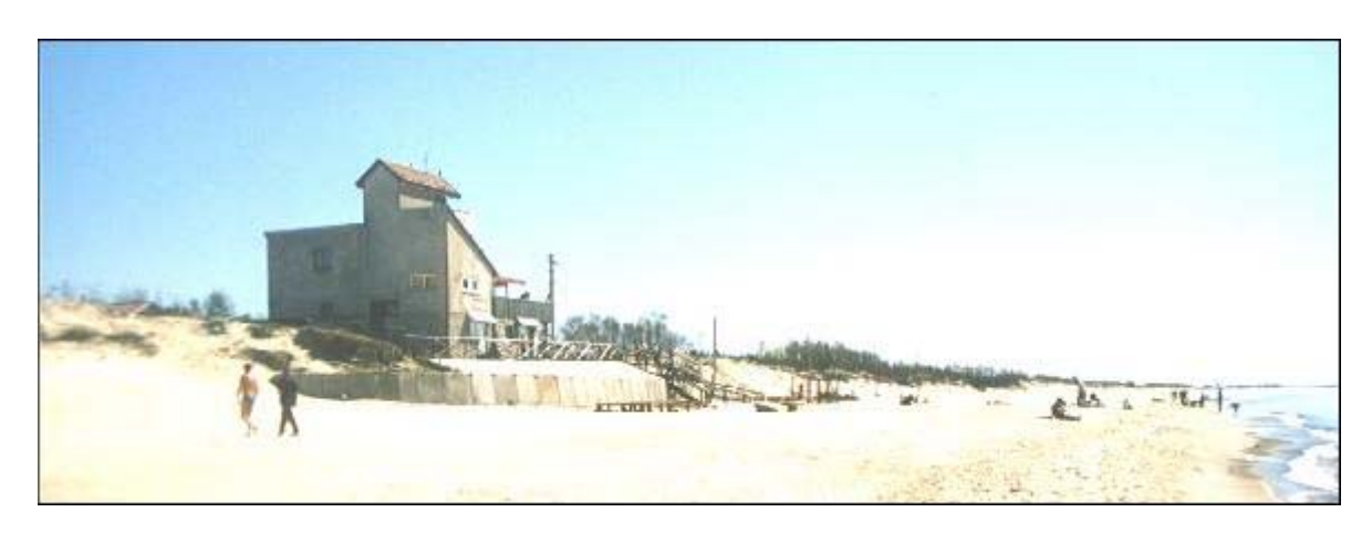
Fig. 3: Melnrage rescue station and leisure facilities with the exposed concrete revetment on the retreating beach. Photo: E. Paplauskis, May 2001.

Agriculture and forestry: No agriculture and forestry of an industrial scale is in this predominantly recreational area. Agricultural activities are of small-scale, whereas forests mainly serve for recreational and conservation purposes.