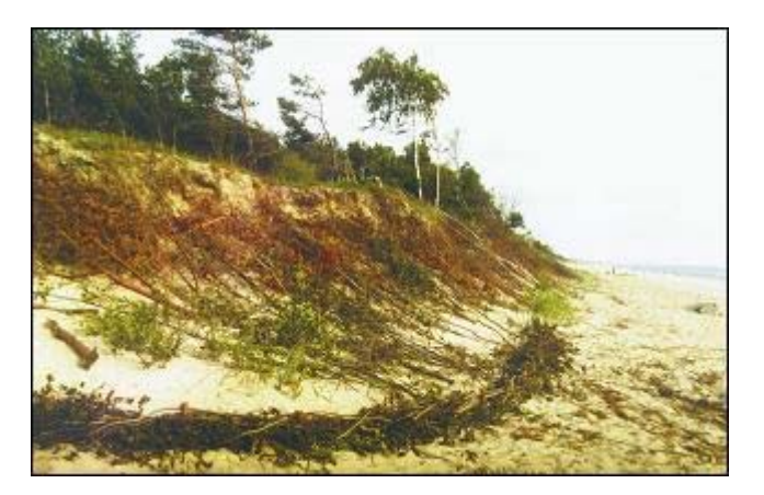
Fig. 6: Eroded foredune fastened with fences and fascines in Pajuris regional park. Photo: E. Paplauskis, June 2001.

Sand dredged from the Klaipeda Seaport gate was applied for the submerged nourishment of the coastal zone in the foreshore at Giruliai in 2001 (Figure 7).