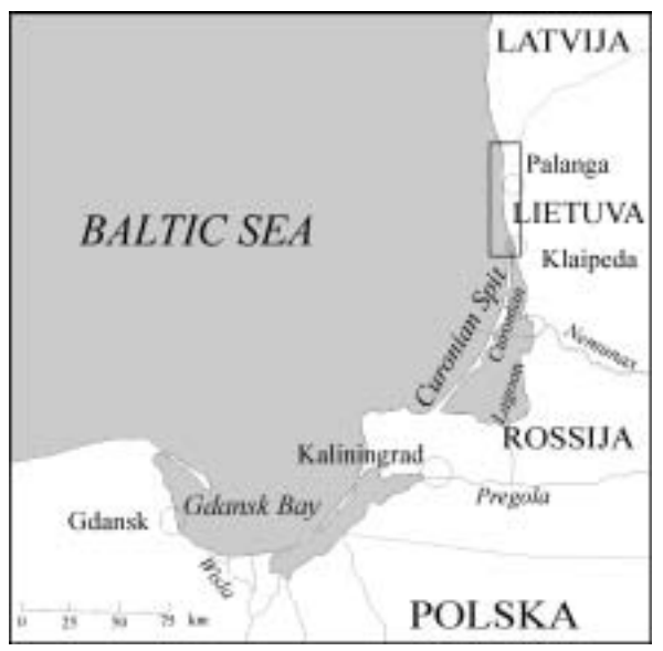
Fig. 1: Location of the case study area.

Within these major coastal types coastal formations and habitats of sandy beaches with bare and vegetated sand dunes prevail.