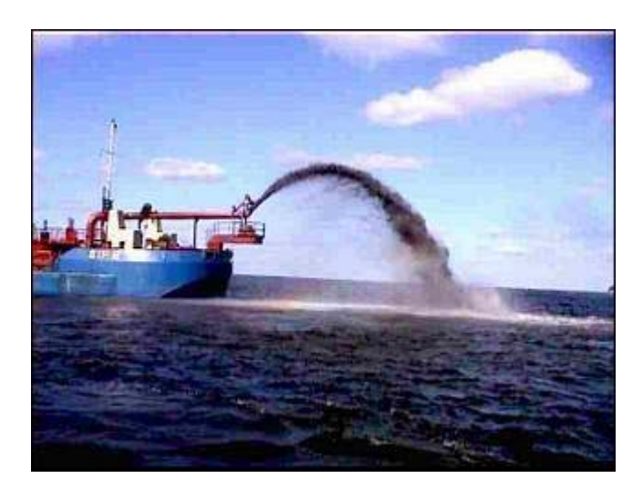
Fig. 7: Submerged foreshore nourishment at Giruliai. Photo: V. Kaunas, April, 2001.

Fig. 6: Eroded foredune fastened with fences and fascines in Pajuris regional park. Photo: E. Paplauskis, June 2001.